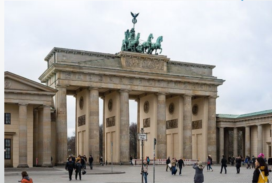
The Brandenburg Gate (Brandenburger Tor) in Berlin