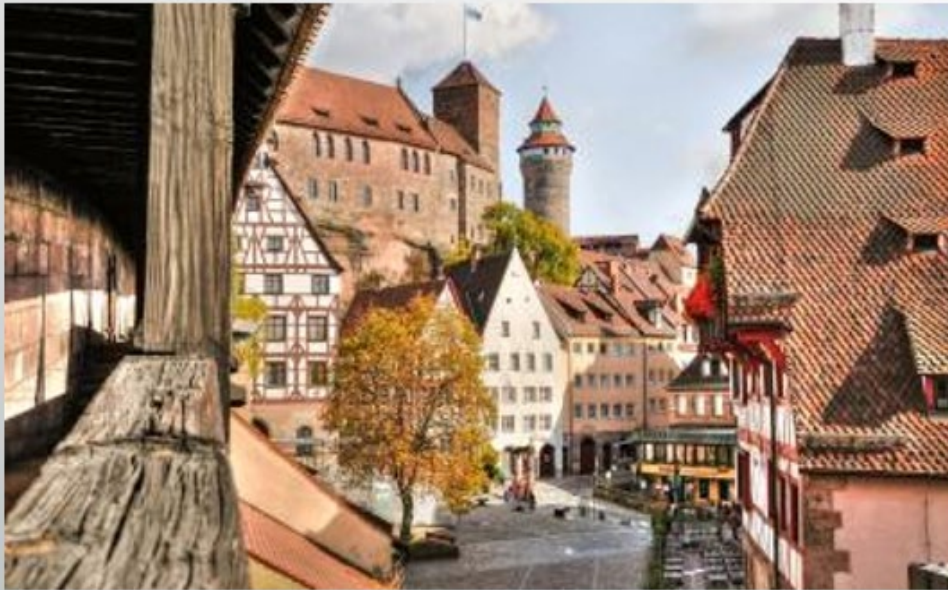
Downtown Nuremberg with a view of the Holy Roman Imperial Palace

Making the most of our ten days in Vienna, Nuremberg and Berlin