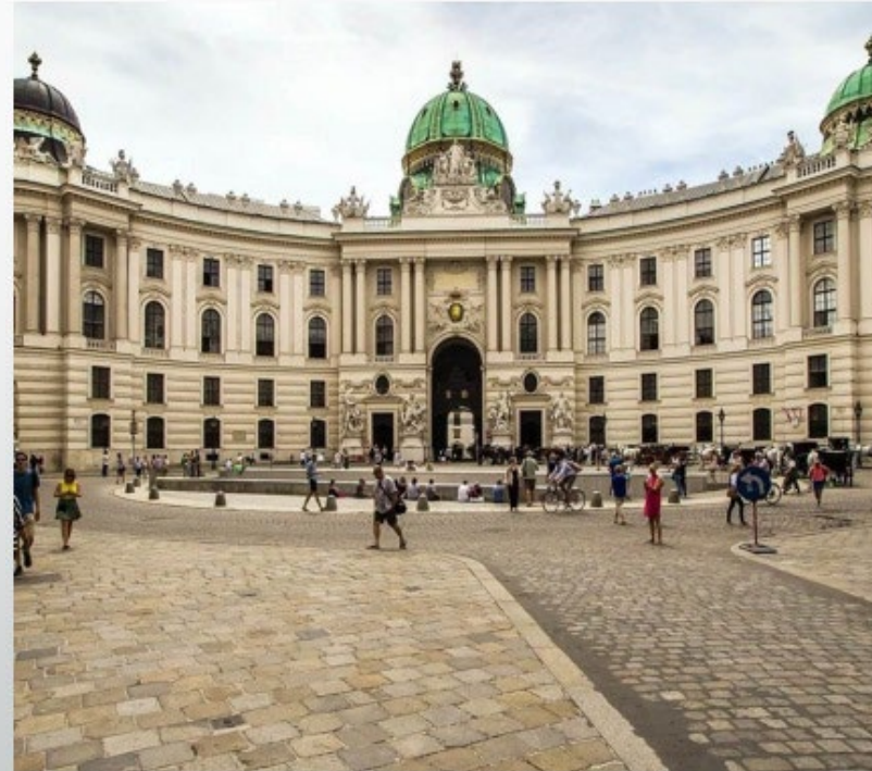
Hapsburg Imperial Palace (Hofburg) in Vienna