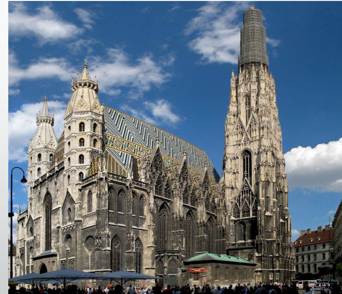
St. Stephens Cathedral (Stephansdom) in Vienna