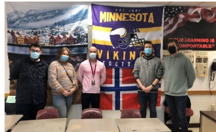
Students from Norway visiting Eden Prairie High School