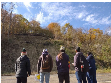
Students in Geomorphology class learning about hazards