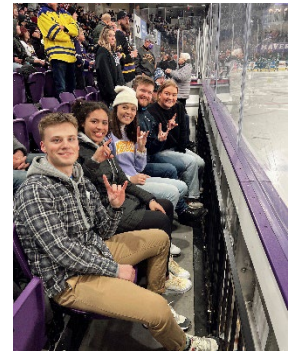
Students at Maverick hockey match