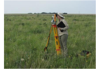
Alyssa Sims collecting soil sample