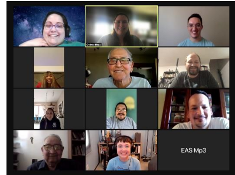
American Indian Virtual Language Camp