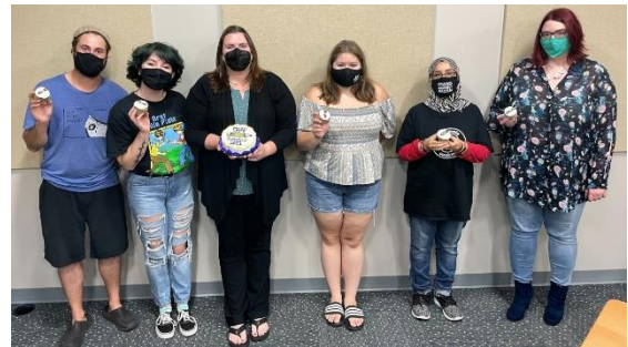
Ojibwe language class

She also carried her tradition even on sabbatical. She brought in her famous pencil cake to Ojibwe language class to celebrate the first day.