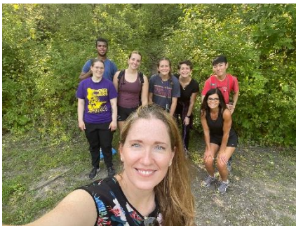
NPL students on hike